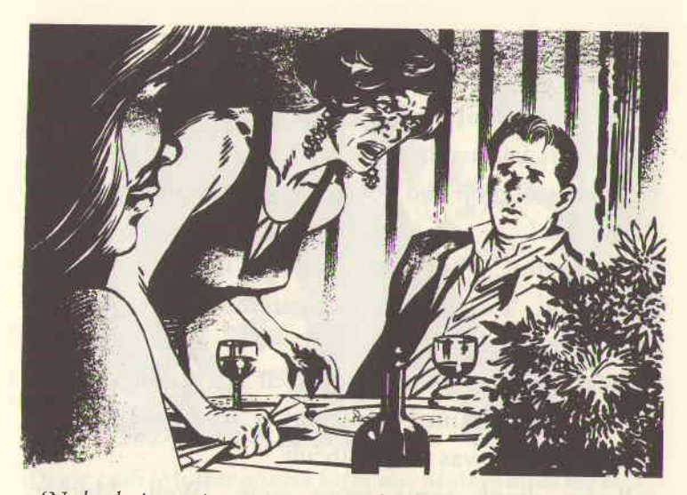
'Nobody is getting more money from me, not before I die.'