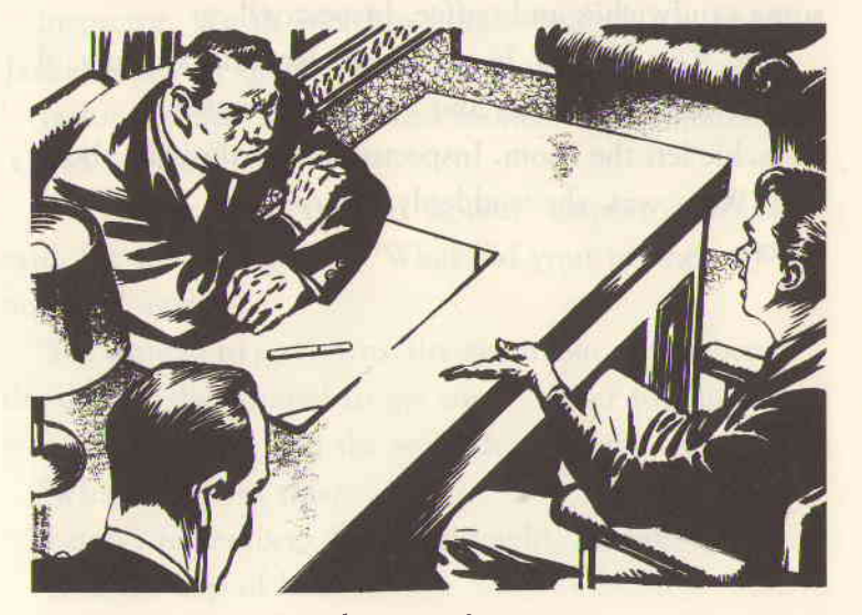
'I need money, that's true.'

'Tell me about your job, Mr Clarkson. Your mother is dead and now you're rich. Do you need money?'