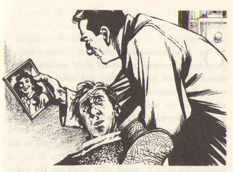
Tom's face went red. 'It's not ... It was a long time ago.'

Inspector Walsh got up and took the picture of the girl from the table. 'Who's this?'